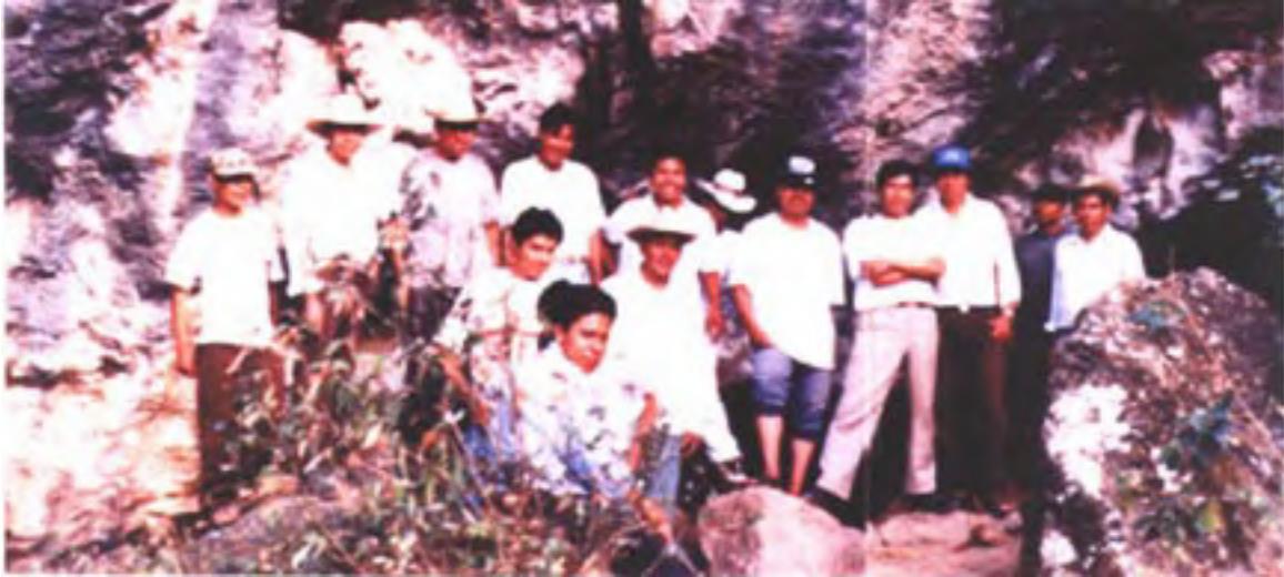
Figure 8. Village men who escorted me to the Caves. (March 1999)

Santa Maria has a very definite hierarchic system with well-defined lines of authority and codes of behavior, including considerable separation of the sexes, at least in the official sphere. Because I was aware of this I asked permission to speak with the women of the village. They have their own semi-formal structure, although not all of them participate in it, but I believed it was important to make myself known to them as I hoped this would help build confidence in regard to my presence in Santa Maria. I also hoped that I might be able to learn something about their customs, for example their use of different plants as food, or for medicinal needs. Permission was granted and the meetings turned out to be particularly interesting. Not only was I an object of much curiosity, but also they asked me to speak to the village officials for them since they had been unsuccessful in getting attention. They wanted some central area set aside as a park/family space for the young children, mothers and elders and felt that activities such as basketball, for the young men for instance, were the only ones receiving support. We made a list of several of their concerns, ranging from the request for "un parque para los niños" to the need for pencils, notebooks, crayons and other school supplies, since some children could not afford these items and therefore often did not attend classes.