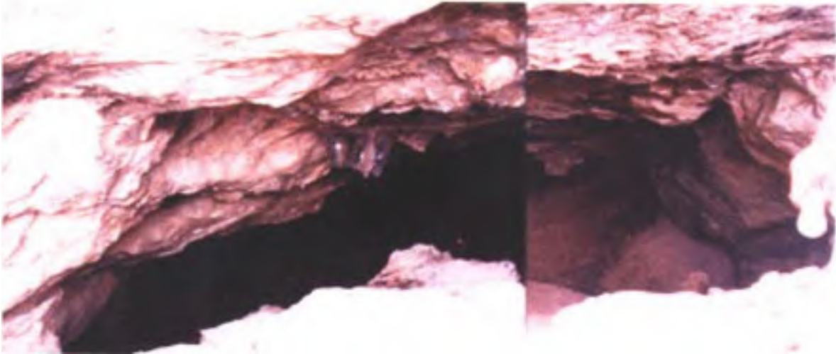
Figure 6. Mouth of the Water Cave. (March 1999)