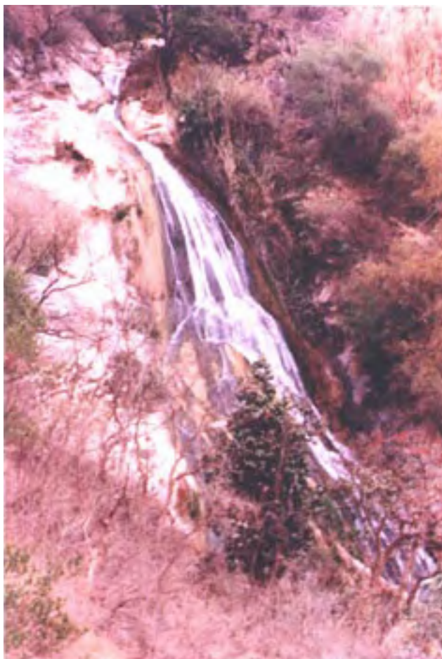
Figure 9. Waterfall formed by the stream from the Water Cave. (March 1999)

It is difficult indeed to comprehend just how great a flow of water is available to Santa Maria during the rainy season when the Cave totally fills with water (according to my informants) if this is what remains after its journey during the dry season. It was the young women who took me to the waterfall, and I certainly never would have found it on my own: Ayme clearly never saw it for he would surely have mentioned such a natural wonder in his records. It may be that there is some sort of gender linkage associated with these water features, but in any case, it is no wonder that the people of Santa Maria guard them today as they did in the past since the life of the village depends in large measure upon careful water management.