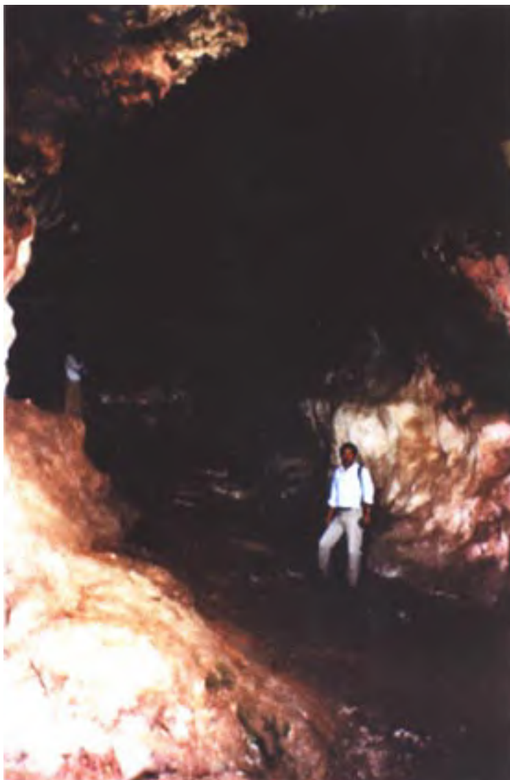
Figure 12. Inside the "Altar Cave." View towards interior and back of cave. (July 2002)

Thanks to considerable advice from colleagues about archives and libraries in Oaxaca, I was able to review materials not available to me before and I began tracing more extensively the history of the different areas where Ayme had collected, using sources including the 1570-1581 Relaciones Geográficas de la Diócesis de Oaxaca which describe the Water Cave "...una queva de tanto hueco como una gran caza..." purported to extend for at least 200 leagues. (Paso y Troncoso) This cave was at least partly explored by the 2 nd Bishop of Oaxaca, Fray Bernardo de Albuquerque at the end of the 16th century during a pastoral visit to the area. The Bishop's attention was also drawn to the custom the native Zapotecs had of making sacrifices to idols within the cave; these idols were probably modified stalagmites. He seems to have taken