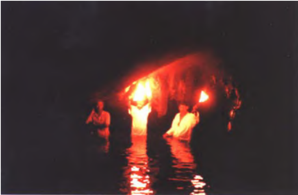
Figure 7. Inside the Water Cave. (March 1999)