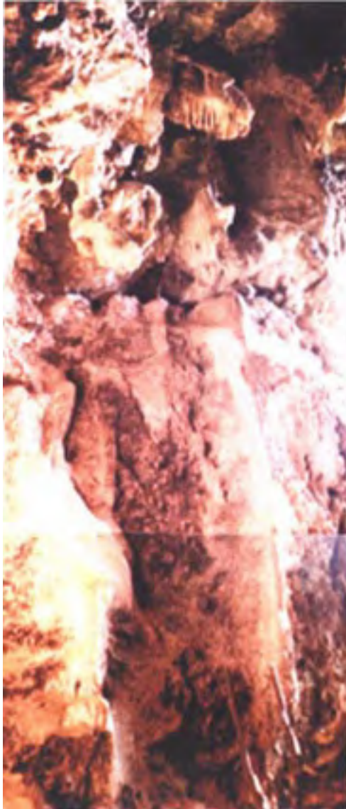
Figure 5. Inside the "Altar Cave." View up and towards opening. (March 1999)

Coming to Santa Maria a second time, again with INAH introductory letters and now under the protection of a family well thought of in the town was most helpful, as was my ability to stay for a more lengthy period. Although the town government changes every year, my earlier visit was remembered, especially after I presented the village officials with photographs I had taken there the year before, a current topographical map of the area and photographs of the stone tools and shells which Ayme had excavated at Santa Maria in 1885. Fourteen of the men of the village, including the municipal officers, escorted me to both of the caves where Ayme had worked, accompanied me inside, held flashlights and torches while I photographed, and then posed for a group picture after our explorations.