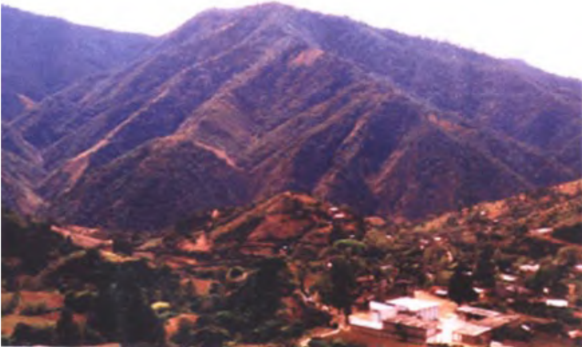
Figure 1. View of Santa Maria Coatlan from the entrance path. (January 1998)