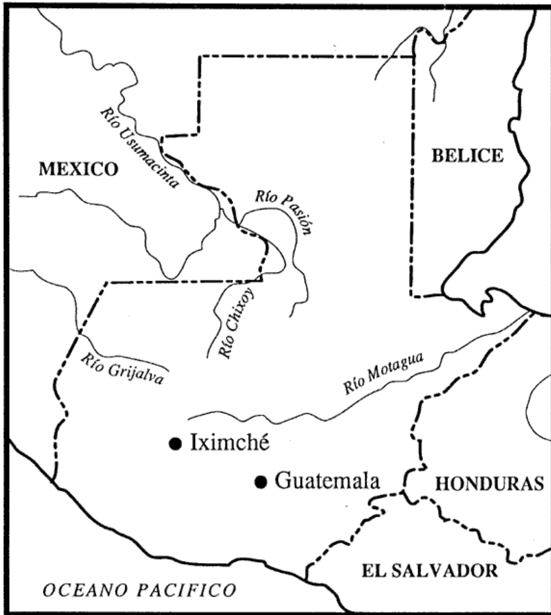
Figure 1. Map of Guatemala, showing the location of Iximché.