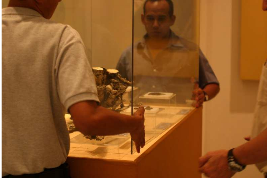
Showcase at the Cerén Museum