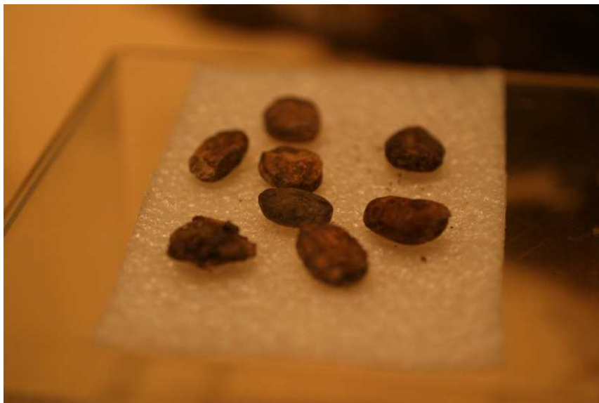
Cacao seeds at the Cerén Museum