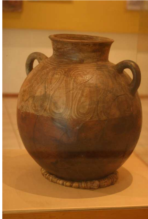
Vase where cacao seeds were found