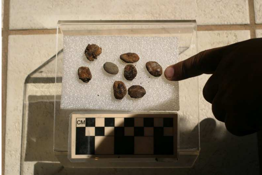
Cacao seeds at the Cerén Museum