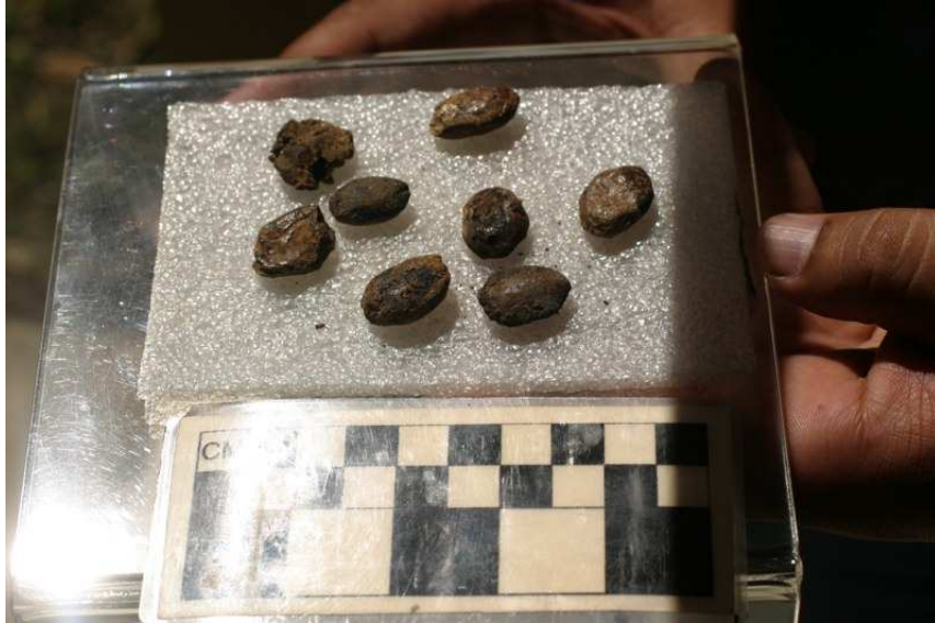
Cacao seeds at the Cerén Museum