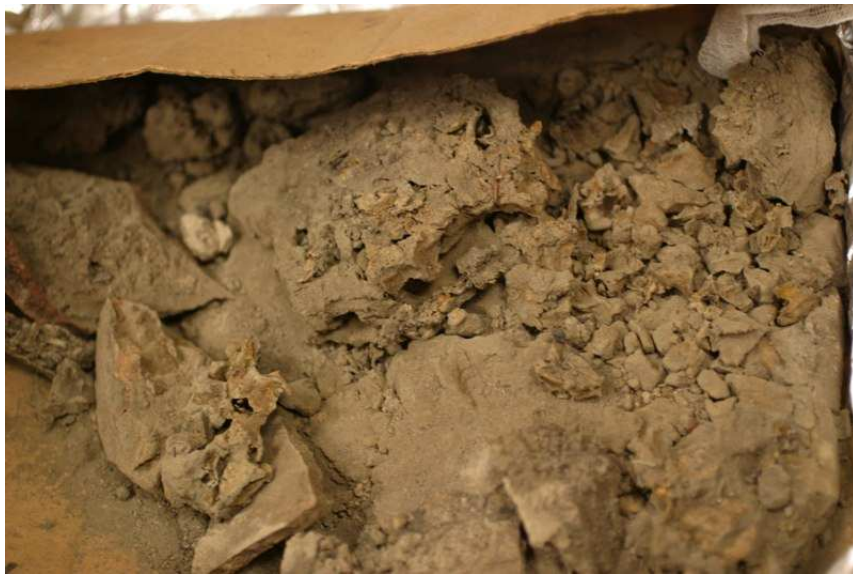
No cacao was found