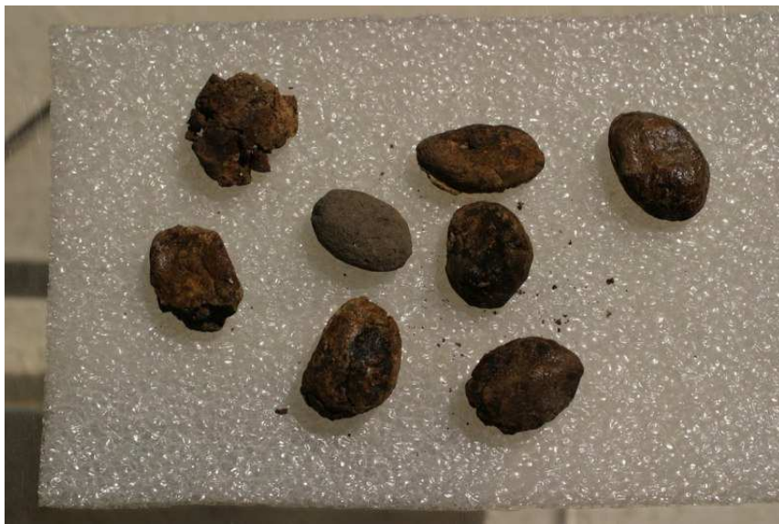
Cacao seeds at the Cerén Museum