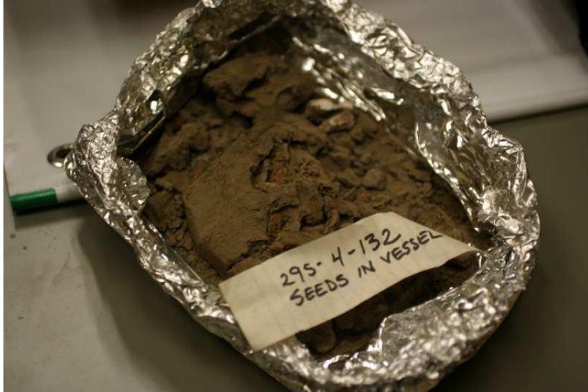
No cacao was found