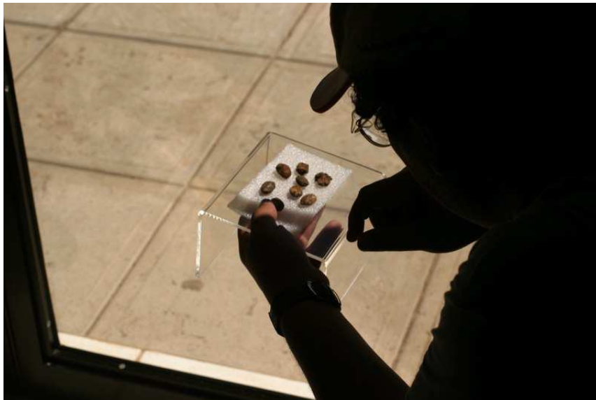
Cacao seeds at the Cerén Museum