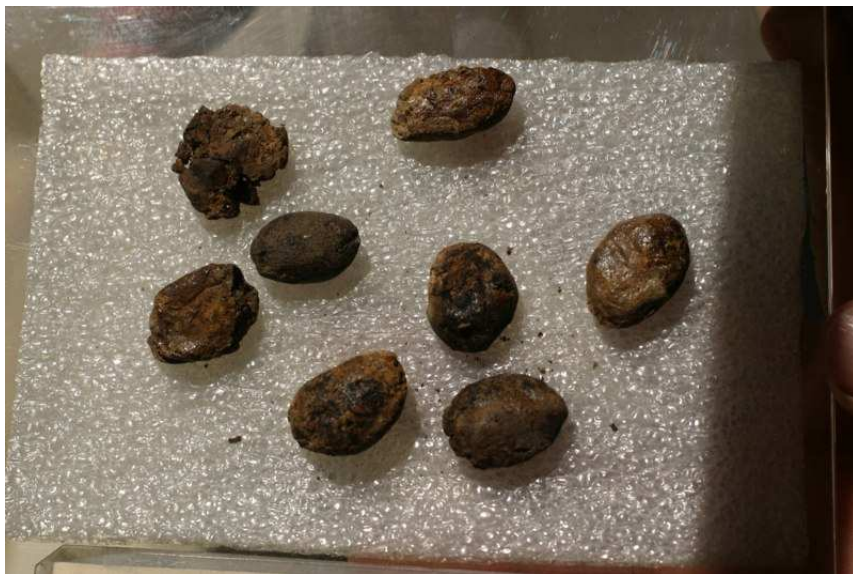
Cacao seeds at the Cerén Museum