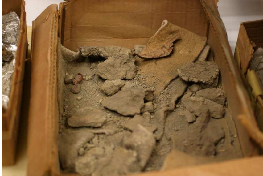
The only box with cacao