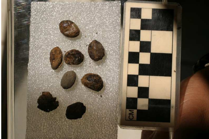
Cacao seeds at the Cerén Museum