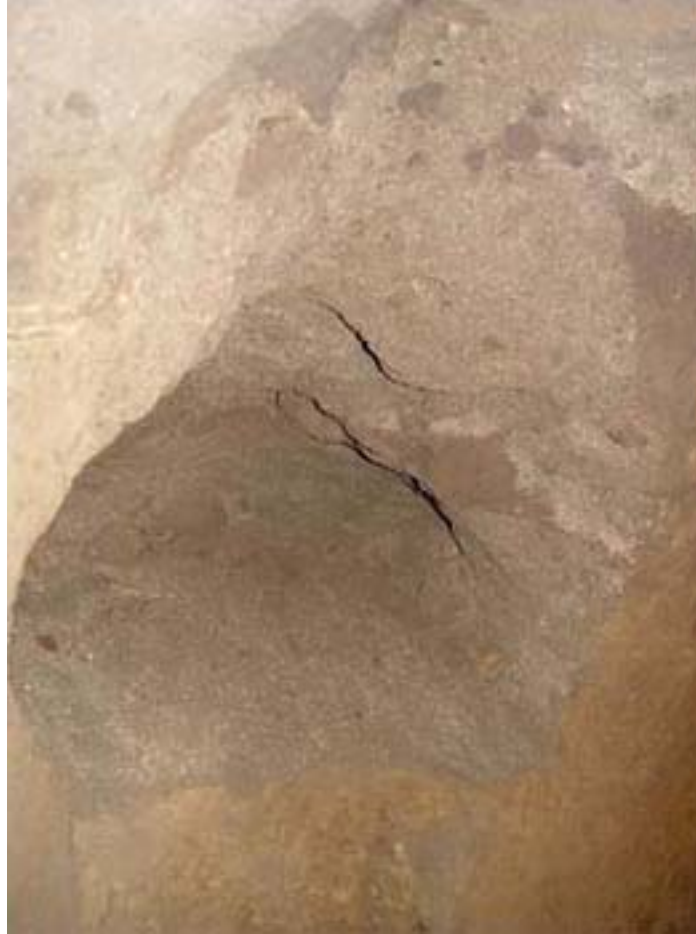
Figure 5. Pit 2 excavated into sterile tepetate underneath the Great Pyramid.

Further evidence for dating this early structure comes from six bell-shaped pits excavated into the sterile tepetate and exposed in the walls of the unrecorded tunnel beneath the phase A construction ( Figure 5 , shown above). Two carbonized beans and an unidentified seed from these features provided three AMS dates: B-188342 [cal A.D. 115 to 385], B-188343 [cal A.D. 45 to 250], and B-188344 [cal 30 B.C. to A.D. 225]. It would appear that the pits probably were filled between A.D. 100 and 200 as part of a resurfacing program related to preparations for the construction of the first stage of the Great Pyramid. Taken together with three dates from inside the reticulated adobe cells of Structure Sub-A (B-162997, B-188345 and B-188346), we can tentatively suggest that this first construction phase was undertaken during the second century A.D. ( Table 1 and Table 2 ).