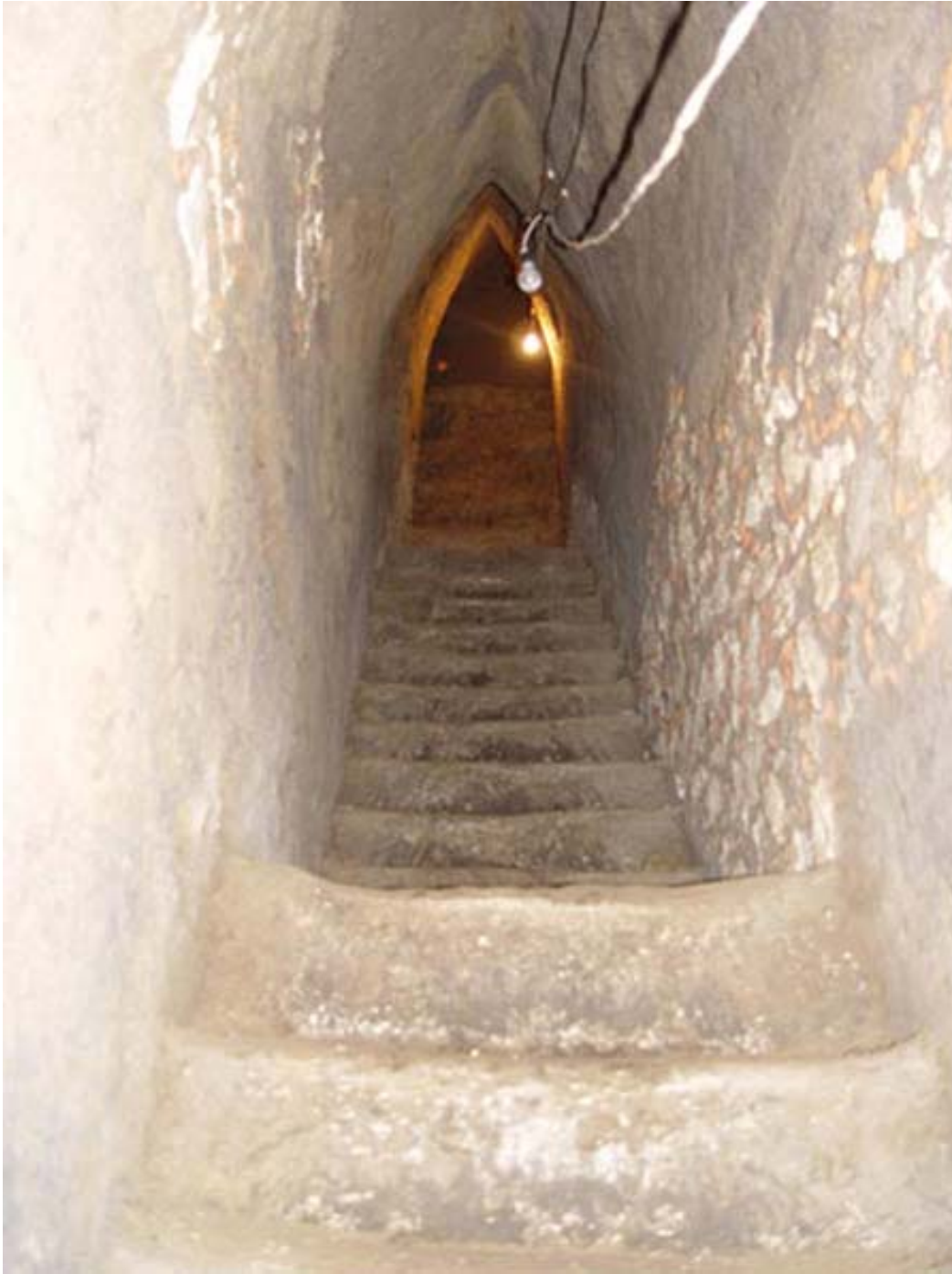
Figure 6. East-West tunnel, following the central staircase of phase A construction.

Marquina (1970a:39) mentions that the north façade of Structure I-B underwent further episodes of modification and enlargement although he provides few details. In her survey of the tunnel walls, Amparo Robles found that there is another talud-tablero façade on the north side that was sliced by the tunnels in the fill that covers Structure I-B, and we have designated this as Structure I-B 1 . We recovered a small sample of