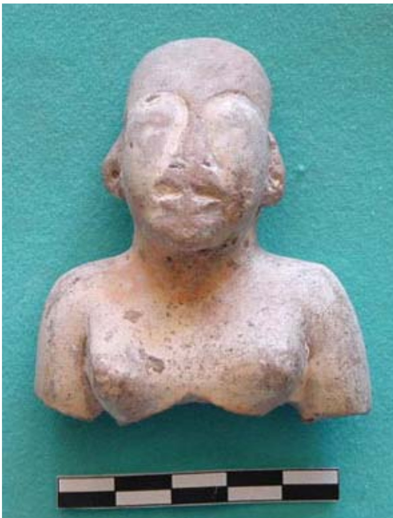
Figure 11. Figurine from bell-shaped pit on Universidad de las Américas, Puebla campus.