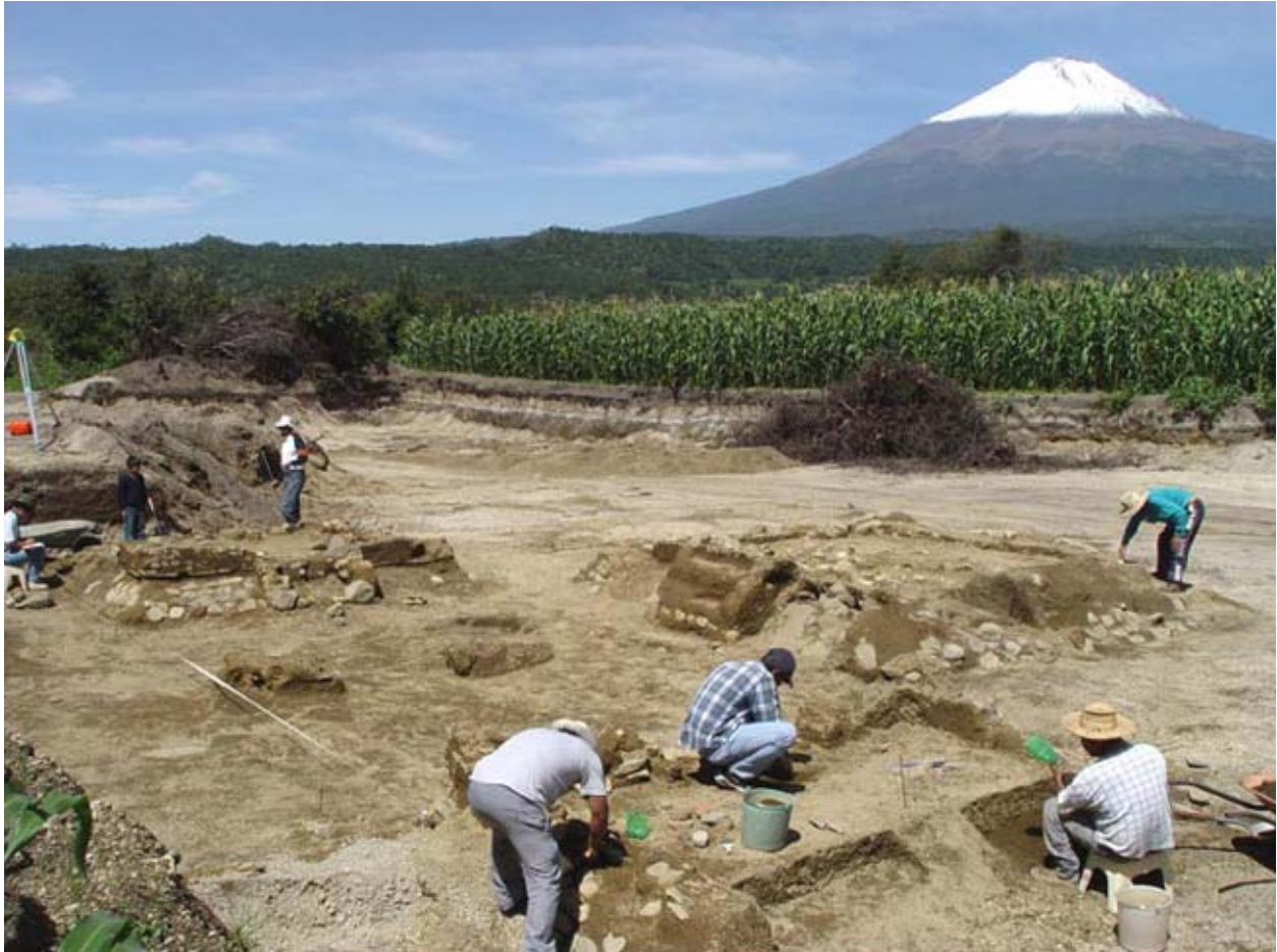
Figure 3. View of house compound (Op. 31) at Tetimpa with the Popocatepetl volcano rising in the background.

second group of dates is important since it can be used to anchor the ceramic assemblages in time.