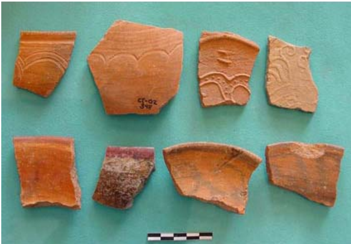
Figure 12. Sample of ceramics from Level K in excavations at the Colegio Taylor.

In May and June of 2002, the Coordinación de Apoyo Arqueológico of the Universidad de las Américas, Puebla, undertook test excavations in a plot of land in the middle of the block that borders the north side of the main square of San Pedro Cholula (López et al. 2002b, 2004a). Although a complex sequence of modern and colonial construction was documented in the 12x2 meter east-west exploratory trench, no remains of prehispanic buildings were located in this excavation. The post-Conquest building activity rests upon about 2.50 meters of interdigitated clays and sands. The lower part of these strata consists of dark clays that contain Late Classic ceramics, deposited directly on the sterile tepetate . These clays are sealed by a 0.20 to 0.30 meter layer of volcanic ash. On top of this ash, Postclassic ceramics, like Cocoyotla Black-on-Orange, which is similar to Aztec I, occur for the first time (Figure 12, shown below). The two dates we obtained from this excavation come from two different strata of waterlain sediments deposited above the volcanic ash.