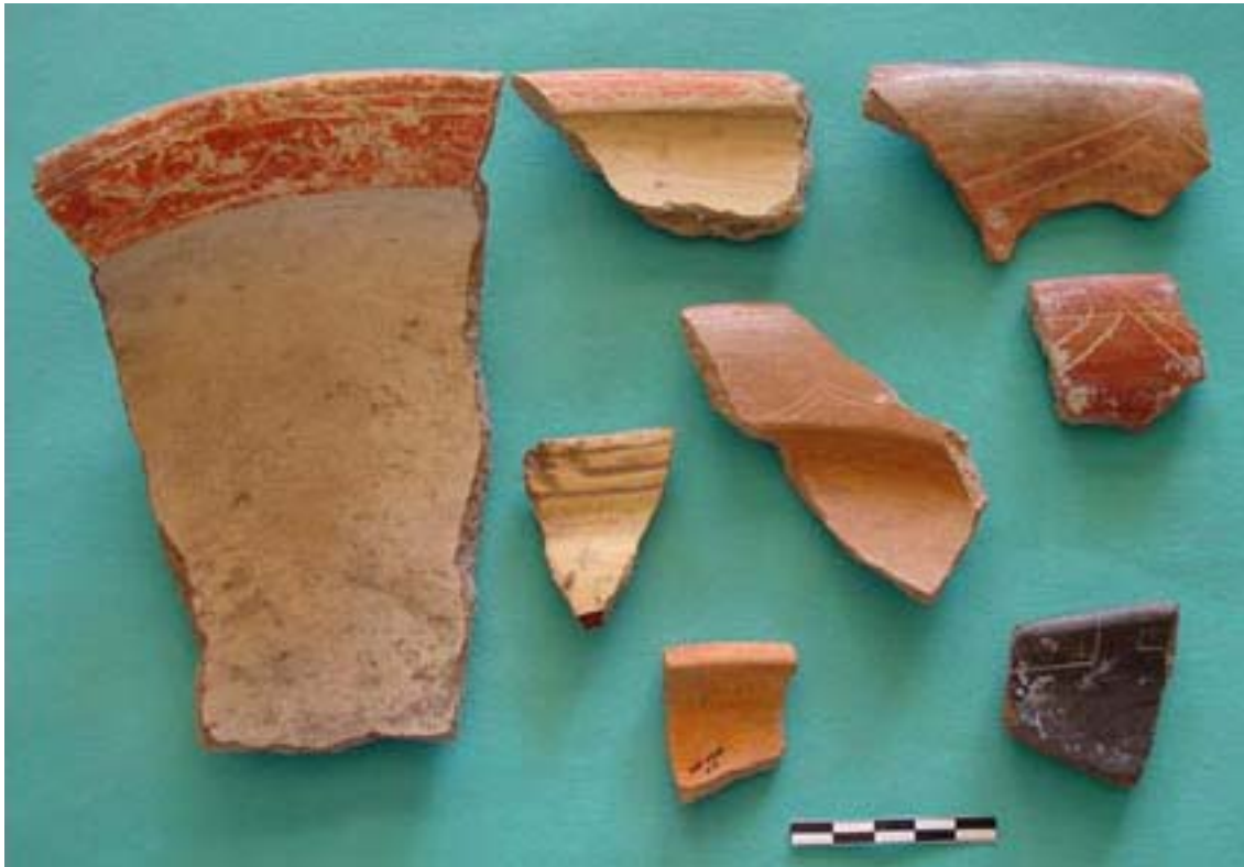
Figure 10. Sample of ceramics recovered from bell-shaped pits on the Universidad de las Américas, Puebla campus.

Mountjoy and Peterson (1973:62) obtained a ^{14}\text{C} date on partially carbonized wood associated with Middle Formative ceramics and figurines from the lower levels of the swamp clay. The sample (GX-2256) yielded a determination of 2645 \pm 110 radiocarbon years or a non-calibrated date of 695 \pm 110 B.C. By running this sample through the Radiocarbon Calibration Program Rev 4.3 (Struiver and Reimer 1993), we obtained an intercept of cal 804 B.C. This date overlaps with the one from the bell-shaped pit, and helps confirm the Middle Formative occupation along the south shore of the Cholula swamp.