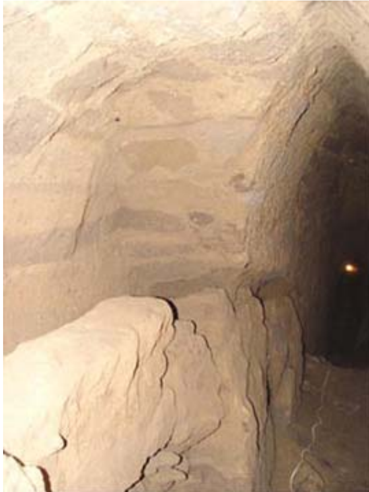
Figure 7. Collapse within Túnel 46, exposing adobe wall 49.

charred material from the fill placed on top of this additional talud-tablero profile, which provided an AMS date with a 2 Sigma range of cal 40 B.C. to A.D. 215 (B-188351). Although this result might indicate that structures I-A, I-B, and I-B 1 were built in rapid succession, we think it is more likely that the Pyramid's architects commonly mined middens from surrounding areas for fill. Significantly, the date does not conflict with our suggestion that Structure I was covered over with an entirely new building (Structure II) perhaps as early as the third or as late as the fifth century A.D.