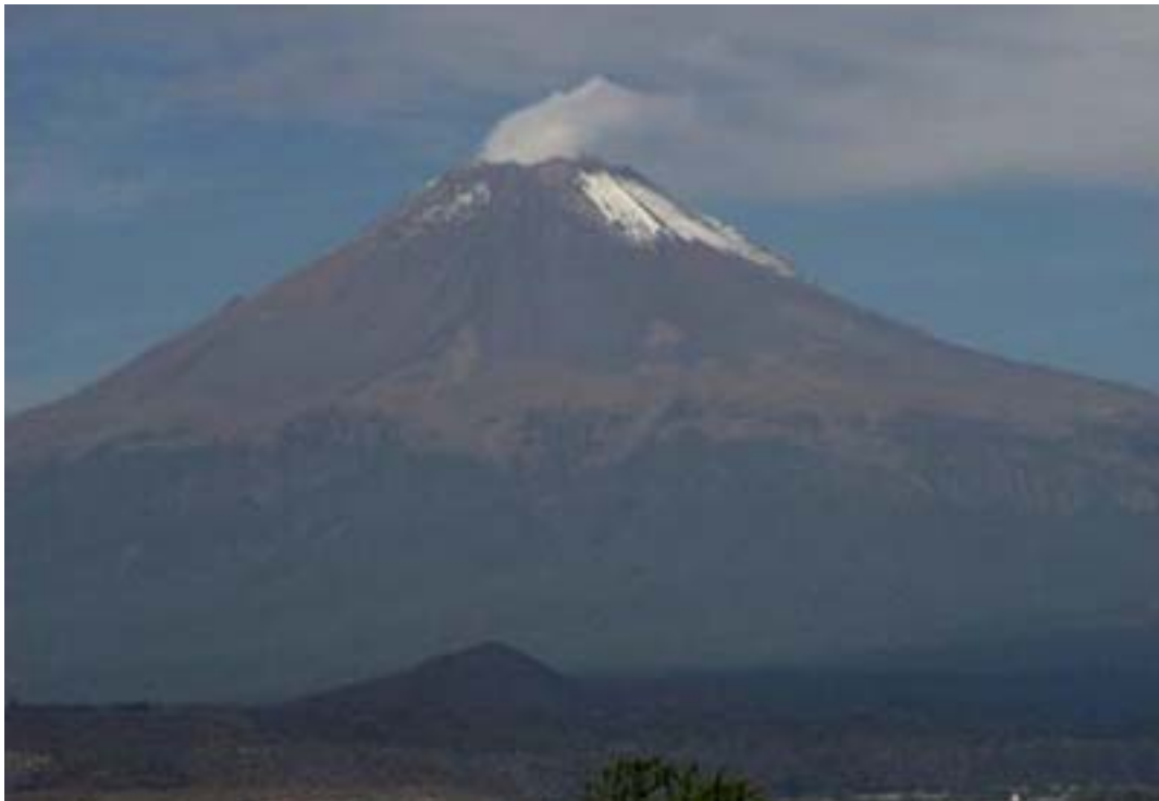
Figure 2. Popocatépetl volcano; the dark band at the base of the volcano is the lava flow known as the Pedregal de Nealtican.

Valley or in greater Mesoamerica. The "Dating Cholula" project was designed to initiate the development of an independent chronological sequence for Cholula based on radiocarbon dates from excavated archaeological contexts. In particular, we wanted to explore the possibility that the monumental architecture of the site developed—at least in part—as an adaptive politico-religious response as people sought to cope with the ecological, social, political, economic, and ideological conflicts that certainly developed in the wake of a huge volcanic eruption of the Popocatépetl volcano, which took place around the middle of the first century A.D. This spectacular event deposited 3.2 km 3 of pumitic lapilli over an area extending at least 25 km east of the crater; shortly thereafter, lava flows covered close to 50 km 2 of the eastern piedmont of the volcano with between 30 and 100 meters of rock that dammed and diverted drainages, altering the surface hydrology of the western Puebla valley (Panfil 1996:16-20).