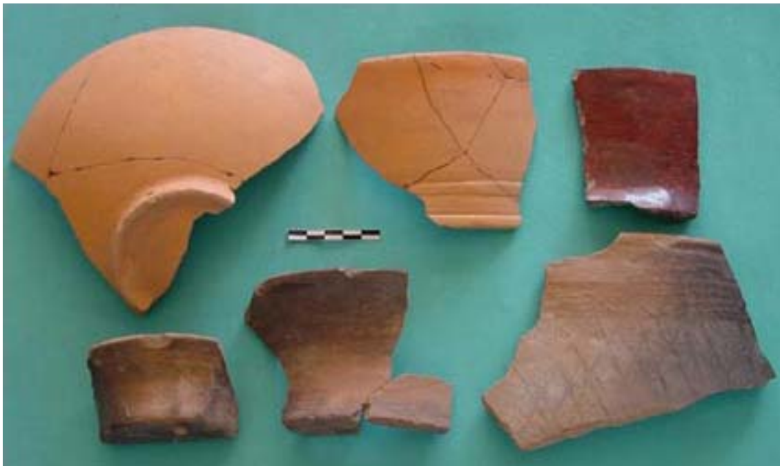
Figure 9. Sample of Classic period ceramics recovered from the water well (Feature 1, Pit 6) at the Rancho de la Virgen.

In a large open field known as Rancho de la Virgen, located to the northeast of the Edificio Rojo that rises at the northeast corner of the Great Pyramid, the Coordinación de Apoyo Arqueológico of the Universidad de las Américas, Puebla, undertook test excavations in 2002 (López et al. 2002a and b). Four adobe platforms were recorded 1.80 to 3.60 meters below the surface in the test pits. We recovered two samples of charred material from the two superimposed adobe platforms in Pit 5, while more organic material came from a water well excavated into the surface of another adobe platform located in Pit 6. All of these dates have 2 Sigma ranges that indicate activity in the Late and Terminal Formative, spanning the second century B.C. through the middle of the third century A.D. Noguera (1956) reported significant amounts of Late Formative material from his excavations at the Edificio Rojo. It would appear then that the area to the north of the Great Pyramid witnessed an important occupation during this time period. However, most of the ceramics associated with the surface of these platforms are from the Early Classic, when the Teotihuacán Tlamimilolpa styles were important and significant amounts of Thin Orange were in use ( Figure 9 , shown below).