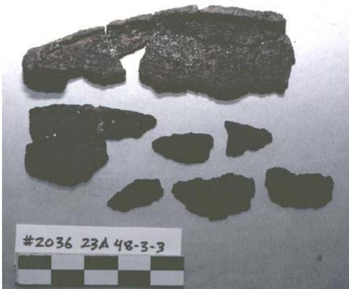
Figure 5. Selected fragments from an object found in Str M8-4, Aguateca [D], showing a curved edge.

Disarticulated fragments in low numbers are less surprising in middens or trash-filled contexts. At Aguateca, a few samples were under a patio [O] and associated with construction debris [P], from a cluster of structures located immediately behind the site's largest temple, on the west side of the Main Plaza; a service relationship is assumed. The fragments from Arroyo de Piedra [R] came from the midden area immediately behind the North Plaza's small palace ( Figure 8 ). The two from Tamarindito [T] were found in wall collapse of part of the palace complex ( Figure 9 ). The fragment from Piedras Negras [U] came from trash-filled layers leveling the plaza of a group probably occupied by elites or by those serving them ( Figure 10 ).