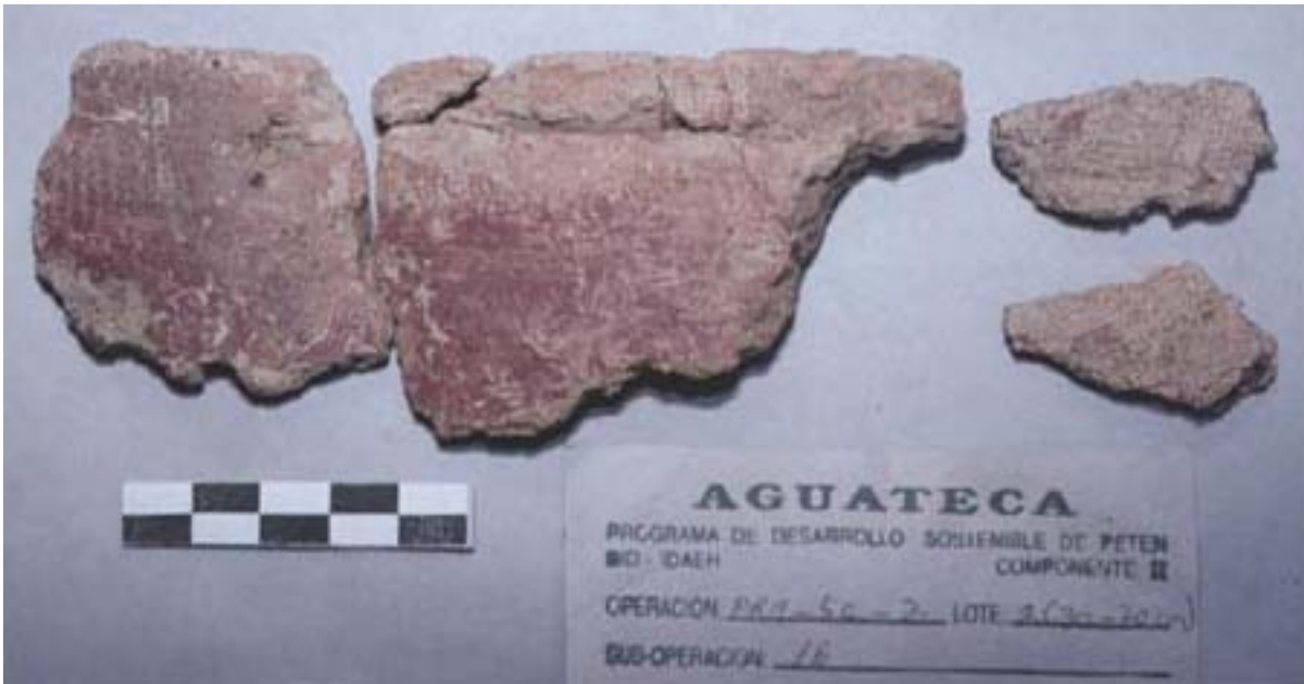
Figure 6. Fragments from Str M8-11, Aguateca [J], with a rim-like edge and red slip coloration.