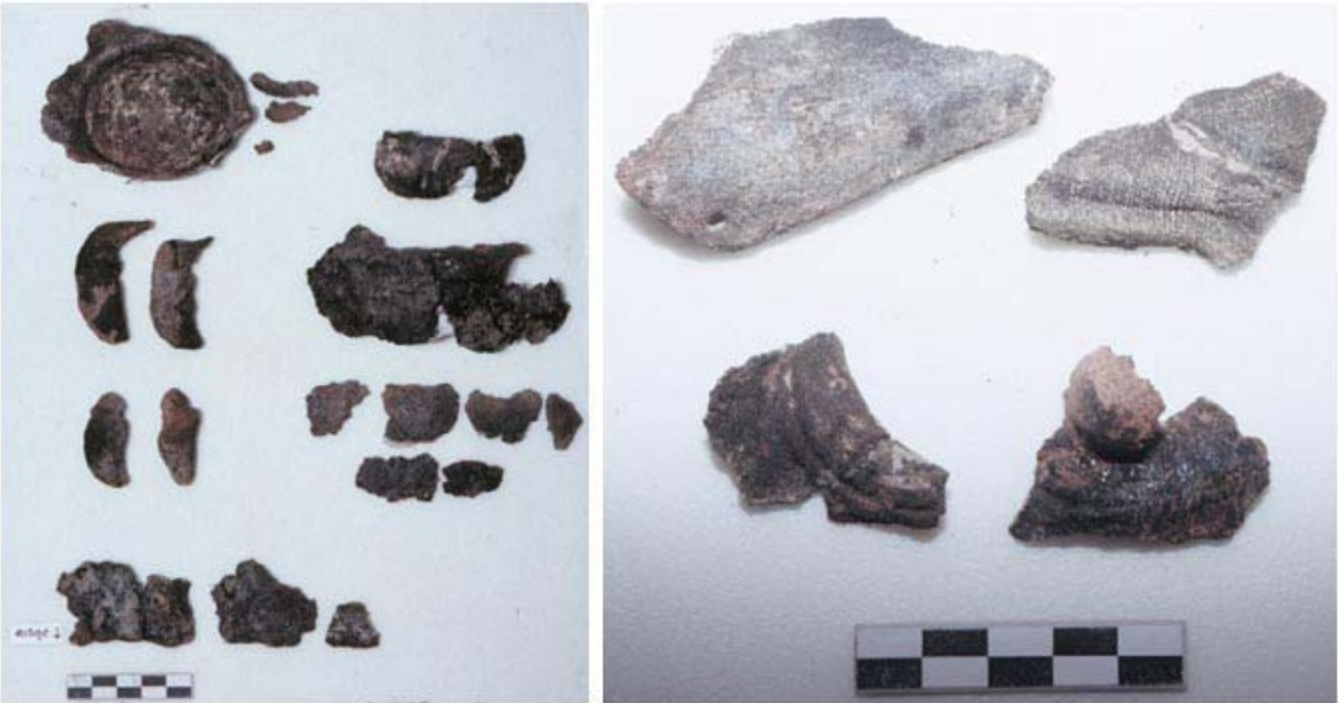
Figure 3. Selected headdress (?) fragments from Str M7-22, Aguateca [B]. The group on the left includes a large eye and four fangs. Finished edges, a perforation and folds are visible in the group on the right.

Bearing superficial resemblance to ceramic sherds, the fragments were shown from the research to be made of multiple layers of woven textile and clay slip. These were assembled and shaped on a mold or support, allowed to dry, modified and then heat-hardened. This last step produced a rigid ceramic that, with the incineration of the fabric component, was also porous and light-weight.