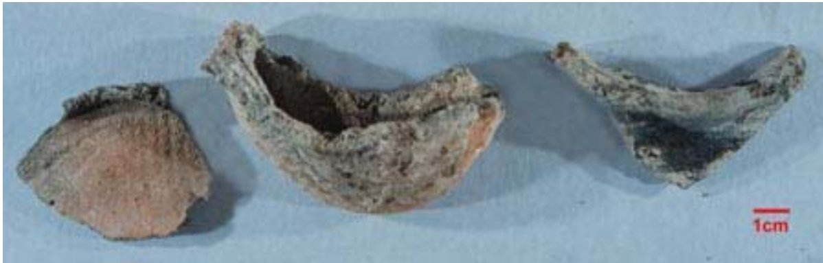
Figure 1. Fragments from Cueva de los Quetzales, Las Pacayas [S]. A perforation is preserved in the left fragment.