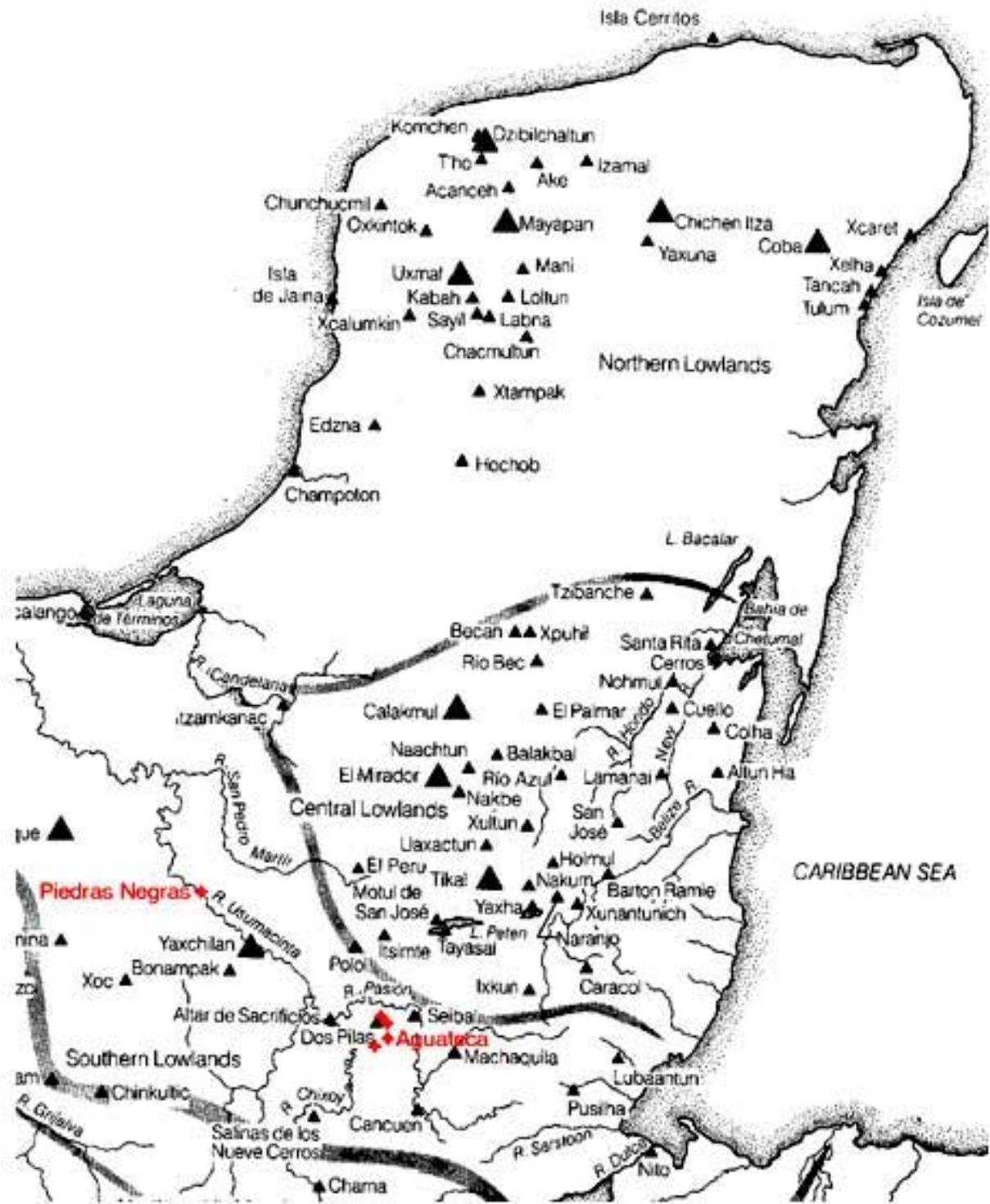
Figure 4. Partial map of the Yucatán Peninsula, showing sites indicated in red that yielded textile-clay laminate samples. Near Aguateca are Arroyo de Piedra and Tamarindito, above, and Las Pacayas/Cueva de los Quetzales, below. [Map modified from Sharer 1994:21]