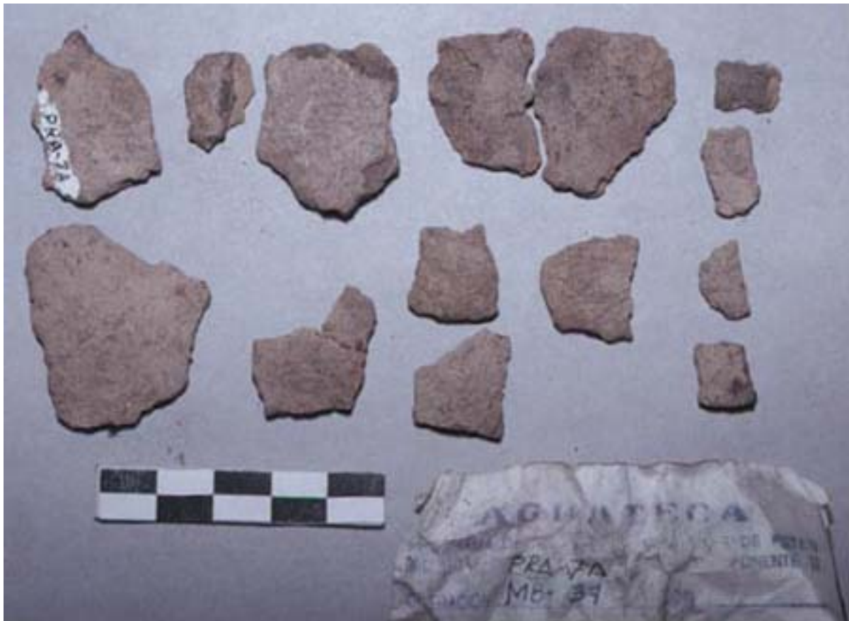
Figure 7. Fragments associated with Str M8-37, Aguateca [L].