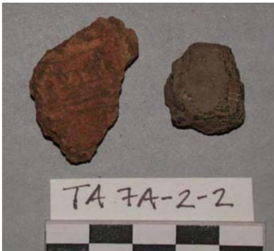
Figure 9. Fragments from Str 5, Group A, Tamarindito [T].