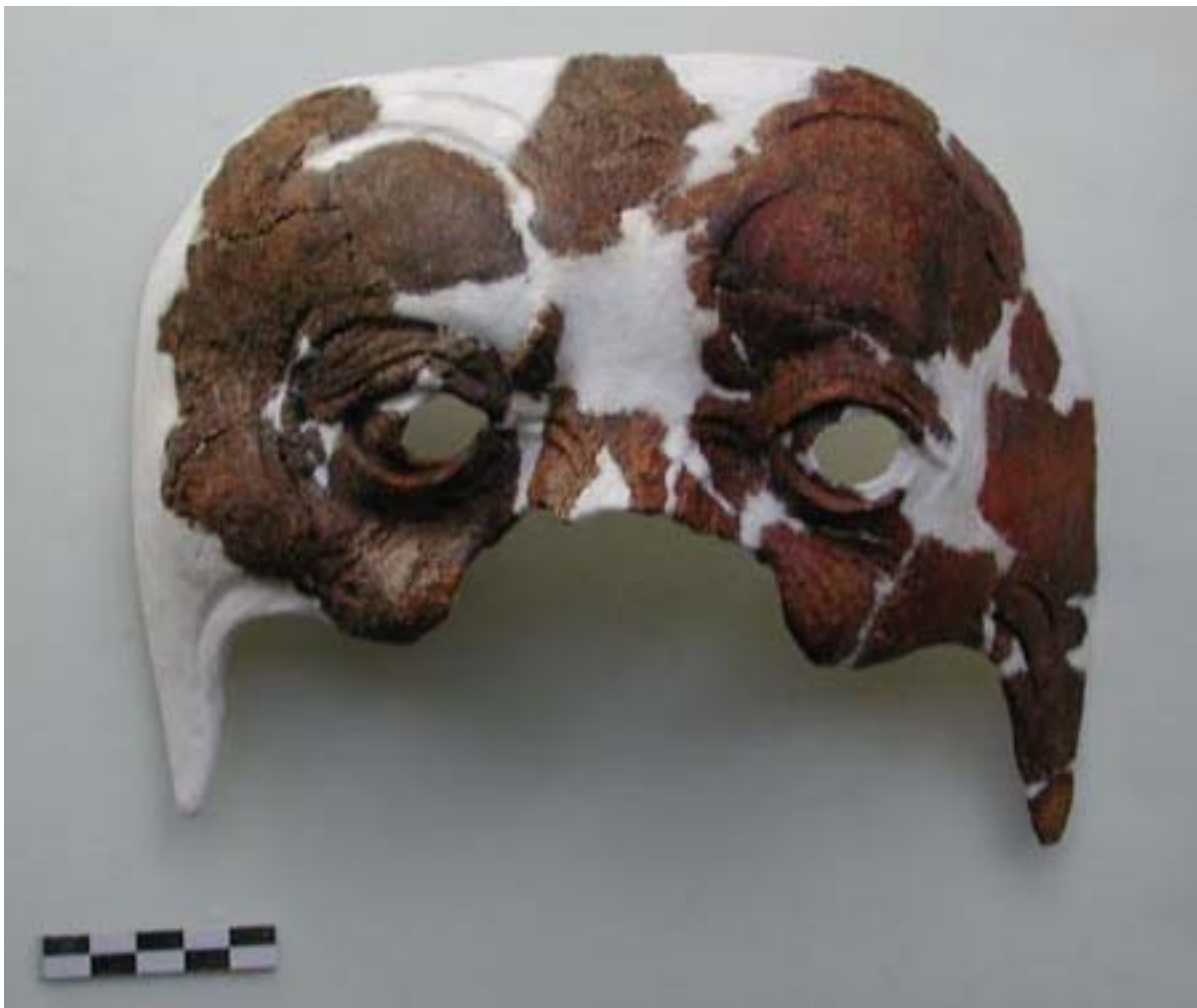
Figure 2. Face mask found in Str M7-22, Aguateca [A]. A perforation is preserved in the right tip, and the outer surface is colored red.