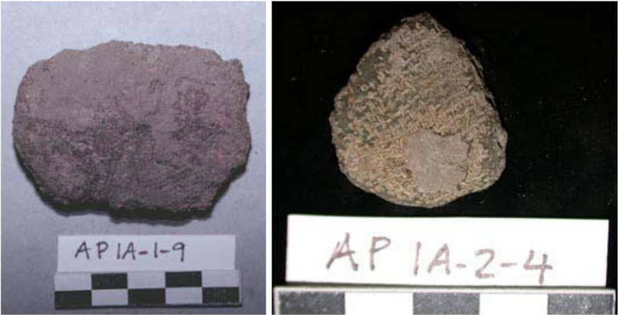
Figure 8. Selected fragments associated with Str 13, Arroyo de Piedra [R]. The fragment on the right has textile impressions of a plain weave variant.